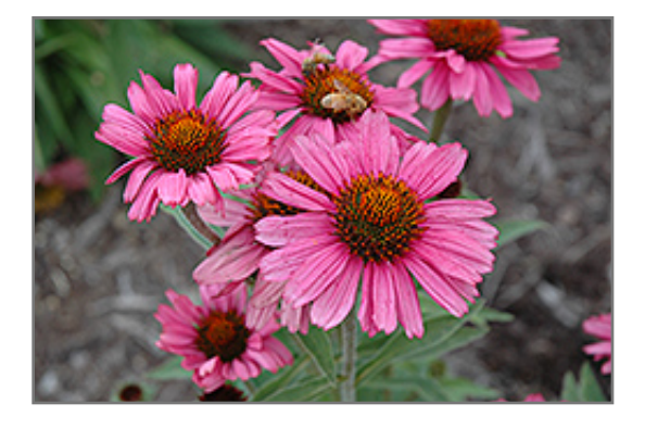
Pink Passion Coneflower flowers