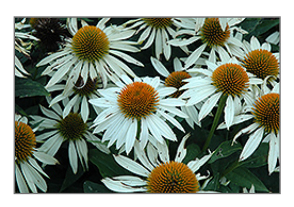
Mystical White Mist Coneflower flowers