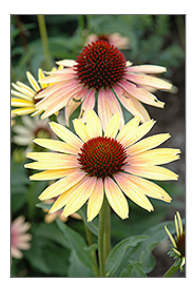
Evening Glow Coneflower flowers