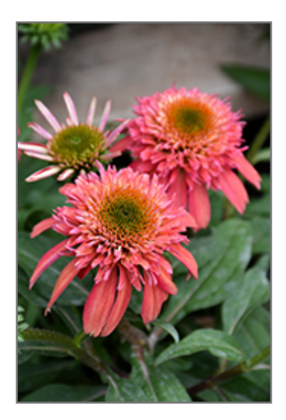
Double Scoop Cranberry Coneflower flowers