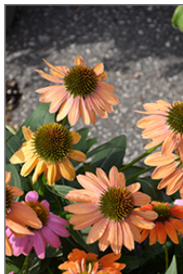
Cheyenne Spirit Coneflower flowers