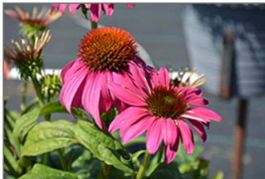
Cheyenne Spirit Coneflower flowers

Cheyenne Spirit Coneflower will grow to be about 16 inches tall at maturity extending to 24 inches tall with the flowers, with a spread of 18 inches. Its foliage tends to remain dense right to the ground, not requiring facer plants in front. It grows at a medium rate, and under ideal conditions can be expected to live for approximately 10 years. As an herbaceous perennial, this plant will usually die back to the crown each winter, and will regrow from the base each spring. Be careful not to disturb the crown in late winter when it may not be readily seen!