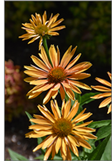
Big Kahuna Coneflower flowers Photo courtesy of NetPS Plant Finder

This is a relatively low maintenance plant, and is best cleaned up in early spring before it resumes active growth for the season. It is a good choice for attracting butterflies to your yard, but is not particularly attractive to deer who tend to leave it alone in favor of tastier treats. It has no significant negative characteristics.