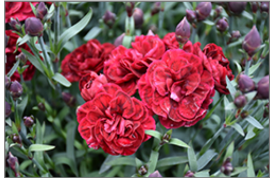
SuperTrouper Butterfly Dark Red Carnation flowers