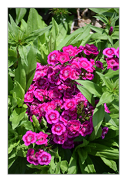
Barbarini Purple Bicolor Sweet William flowers

Barbarini Purple Bicolor Sweet William is recommended for the following landscape applications: