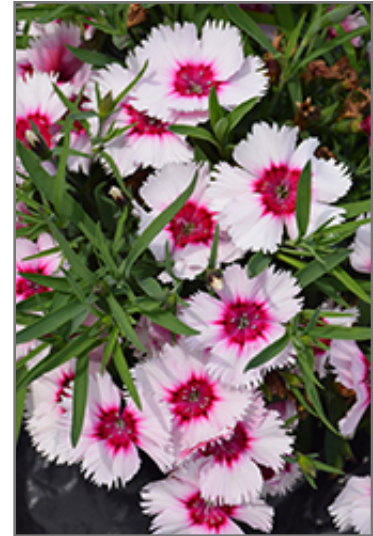
Super Parfait Raspberry Pinks flowers

Super Parfait Raspberry Pinks is a fine choice for the garden, but it is also a good selection for planting in outdoor pots and containers. It is often used as a 'filler' in the 'spiller-thriller-filler' container combination, providing a mass of flowers and foliage against which the thriller plants stand out. Note that when growing plants in outdoor containers and baskets, they may require more frequent waterings than they would in the yard or garden. Be aware that in our climate, most plants cannot be expected to survive the winter if left in containers outdoors, and this plant is no exception. Contact our experts for more information on how to protect it over the winter months.