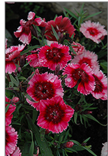
Super Parfait Raspberry Pinks flowers