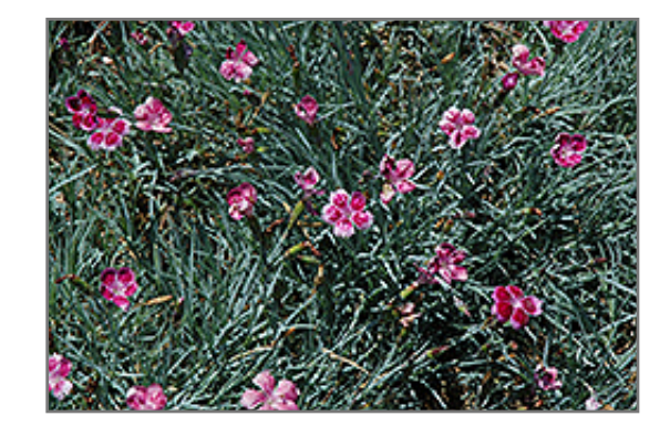
Pixie Pinks flowers

Pixie Pinks is recommended for the following landscape applications;