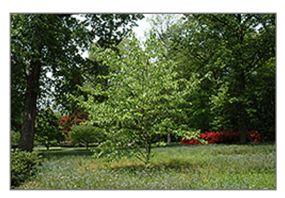
Dove Tree

Dove Tree is recommended for the following landscape applications;