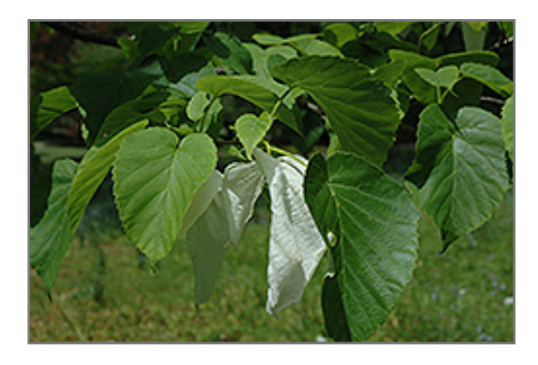
Dove Tree flowers

An exotic deciduous tree that is broadly pyramidal in habit when young; small reddish-purple flowers in spring have large white bracts that are visually stunning, giving the tree its common names; may not flower for first ten years