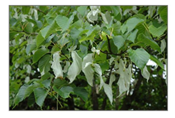
Dove Tree foliage

This tree should only be grown in full sunlight. It prefers to grow in average to moist conditions, and shouldn't be allowed to dry out. It is not particular as to soil type or pH. It is somewhat tolerant of urban pollution. This species is not originally from North America.