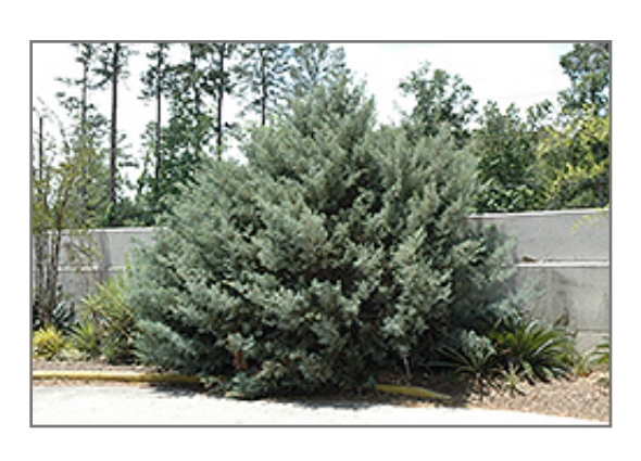
Carolina Sapphire Arizona Cypress

Carolina Sapphire Arizona Cypress is recommended for the following landscape applications;