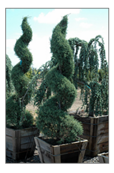
Carolina Sapphire Arizona Cypress

This tree should only be grown in full sunlight. It prefers dry to average moisture levels with very well-drained soil, and will often die in standing water. It is considered to be drought-tolerant, and thus makes an ideal choice for xeriscaping or the moisture-conserving landscape. It is not particular as to soil pH, but grows best in sandy soils. It is somewhat tolerant of urban pollution. This is a selection of a native North American species.