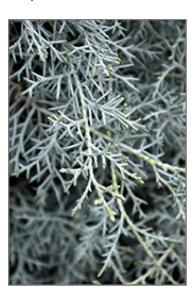
Carolina Sapphire Arizona Cypress foliage