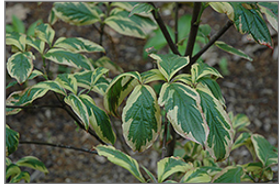
Firebird Flowering Dogwood foliage