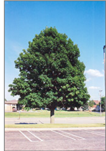
Emerald Queen Norway Maple

Emerald Queen Norway Maple will grow to be about 50 feet tall at maturity, with a spread of 40 feet. It has a high canopy with a typical clearance of 7 feet from the ground, and should not be planted underneath power lines. As it matures, the lower branches of this tree can be strategically removed to create a high enough canopy to support unobstructed human traffic underneath. It grows at a fast rate, and under ideal conditions can be expected to live to a ripe old age of 100 years or more; think of this as a heritage tree for future generations!