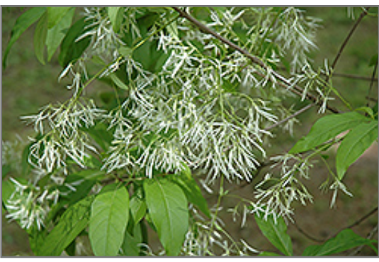
Spring Fleecing Fringetree flowers