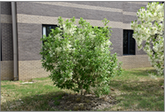
Spring Fleecing Fringetree in bloom