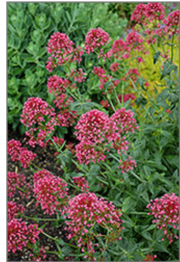
Red Valerian flowers

Red Valerian is recommended for the following landscape applications;