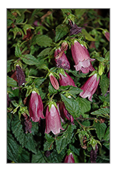
Ringsabell Mulberry Rose Bellflower flowers

Ringsabell Mulberry Rose Bellflower features unusual nodding rose bell-shaped flowers with pink overtones at the ends of the stems from late spring to mid summer. Its attractive serrated heart-shaped leaves are dark green in colour. As an added bonus, the foliage turns a gorgeous brick red in the fall.