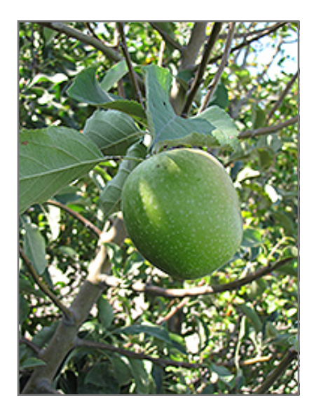
Granny Smith Apple fruit

Granny Smith Apple features showy clusters of lightly-scented white flowers with shell pink overtones along the branches in mid spring, which emerge from distinctive pink flower buds. It has forest green deciduous foliage. The pointy leaves turn yellow in fall. The fruits are showy light green apples carried in abundance in early fall. The fruit can be messy if allowed to drop on the lawn or walkways, and may require occasional clean-up.