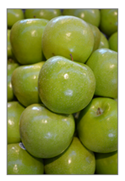
Granny Smith Apple fruit

This tree is typically grown in a designated area of the yard because of its mature size and spread. It should only be grown in full sunlight. It prefers to grow in average to moist conditions, and shouldn't be allowed to dry out. It is not particular as to soil type or pH. It is highly tolerant of urban pollution and will even thrive in inner city environments. This particular variety is an interspecific hybrid.