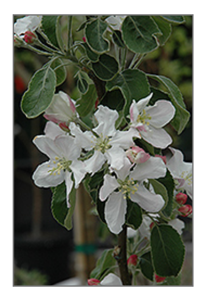
Granny Smith Apple flowers