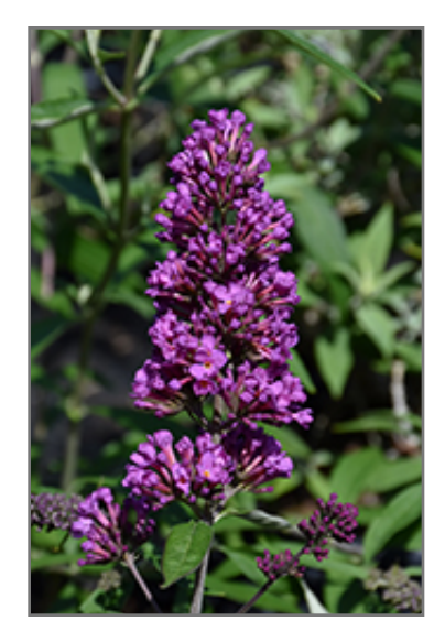
Flutterby Petite Tutti Fruitti Pink Butterfly Bush flowers

A compact variety with a tidy upright habit; cone shaped clusters of fuchsia flowers with orange centers all summer; attracts butterflies; gray-green foliage is full and dense; may be cut back each spring, as it blooms on new wood