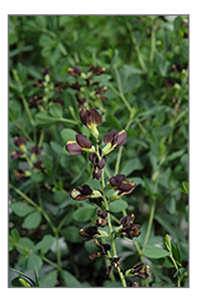
Decadence Dutch Chocolate False Indigo flowers

Decadence Dutch Chocolate False Indigo has masses of beautiful spikes of dark brown pea-like flowers with purple overtones rising above the foliage from late spring to early summer, which are most effective when planted in groupings. The flowers are excellent for cutting. Its oval leaves remain bluish-green in colour throughout the season. The fruits are showy black pods displayed in late summer.