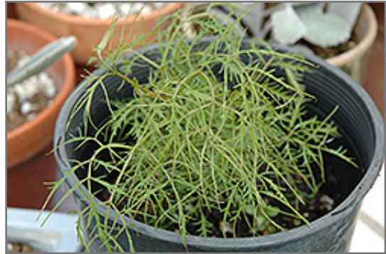
Whirlwind Goatsbeard foliage

Other Names: Cutleaf Goatsbeard, Goats Beard