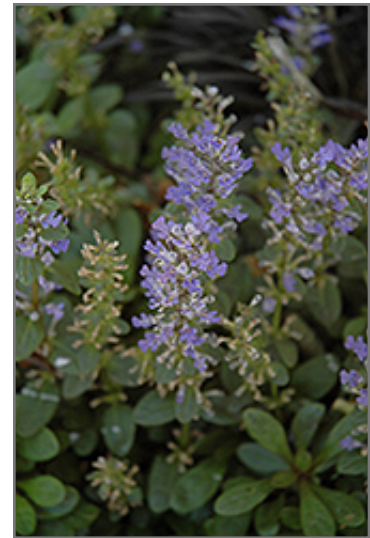
Mint Chip Bugleweed flowers

A lush, mint green carpet bugle that will light up the garden with multitudes of tiny blue flowers in spring; vigorous, excellent for containers, as a groundcover and in borders; tolerates any soil with good drainage