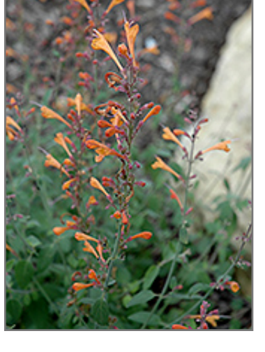
Tango Hyssop flowers

This variety produces glorious fragrant spikes of fiery orange flowers; strong, compact form is great in borders and containers; for the best performance plant in fertile, well-drained soil in full sun