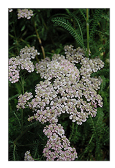
Summer Berries Yarrow flowers

Summer Berries Yarrow is recommended for the following landscape applications;