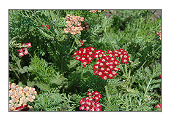
Song Siren Laura Yarrow flowers

Stunning red blooms with contrasting white centers, above a tidy growth habit will add interesting texture and color; excellent for xeriscaping and hot, sunny, dry locations in the garden; performs well on hot sites