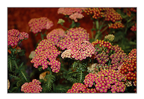
New Vintage Rose Yarrow flowers

Lovely rose flowers with good color retention, and no gap between flowers and foliage; an attractive container plant; excellent for xeriscaping and hot, sunny, dry locations in the garden; performs well on hot sites