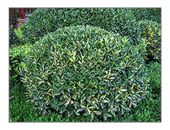
Moonshadow Wintercreeper