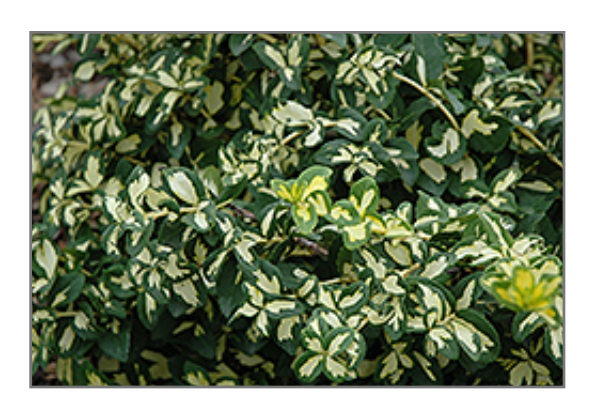
Moonshadow Wintercreeper foliage