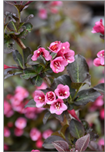
Tango Weigela flowers

Tango Weigela is recommended for the following landscape applications;