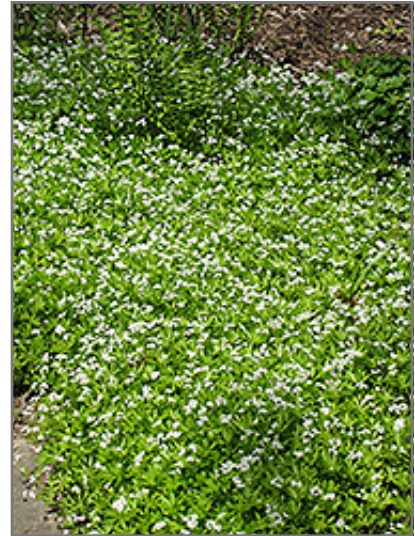
Sweet Woodruff in bloom