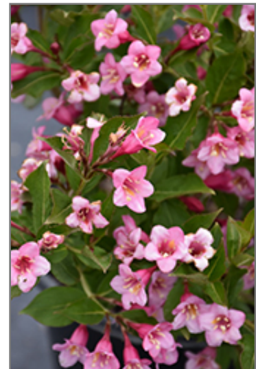
Minuet Weigela flowers