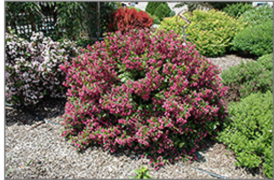
Minuet Weigela in bloom

Minuet Weigela is recommended for the following landscape applications;