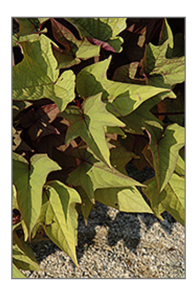
Bright Ideas Rusty Red Sweet Potato Vine foliage

Bright Ideas Rusty Red Sweet Potato Vine will grow to be about 12 inches tall at maturity, with a spread of 24 inches. Its foliage tends to remain dense right to the ground, not requiring facer plants in front. This fast-growing annual will normally live for one full growing season, needing replacement the following year.