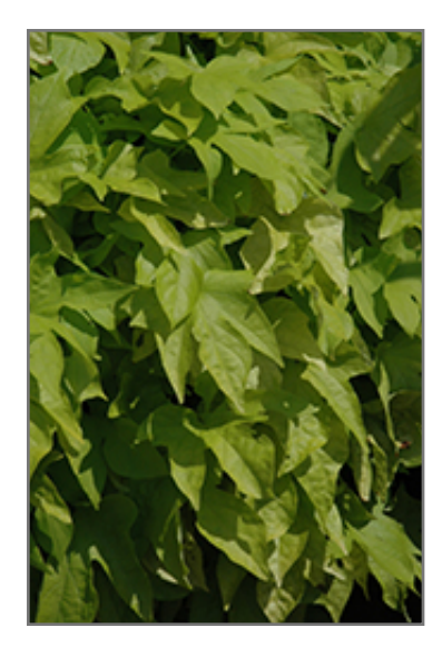
Bright Ideas Lime Sweet Potato Vine foliage

Bright Ideas Lime Sweet Potato Vine will grow to be about 12 inches tall at maturity, with a spread of 24 inches. Its foliage tends to remain dense right to the ground, not requiring facer plants in front. This fast-growing annual will normally live for one full growing season, needing replacement the following year.