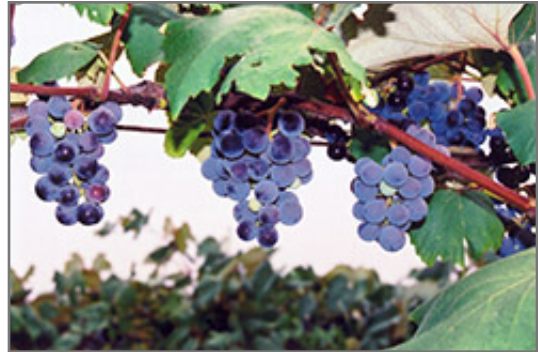
Concord Grape fruit