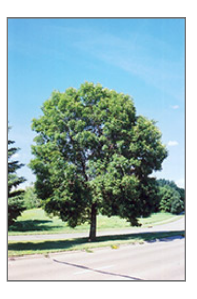
Green Ash