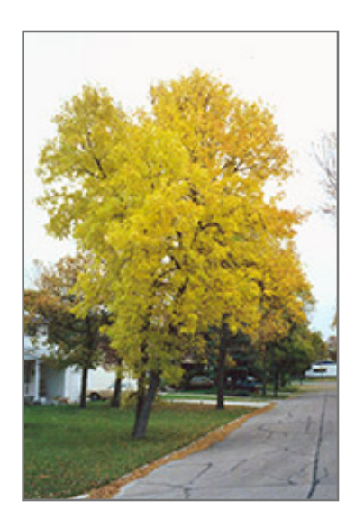
Green Ash in fall