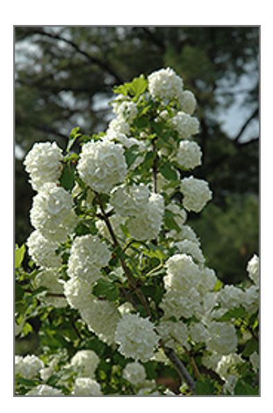
Snowball Viburnum flowers