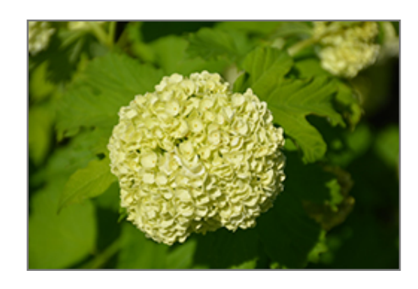
Snowball Viburnum flowers

Snowball Viburnum will grow to be about 12 feet tall at maturity, with a spread of 10 feet. It tends to be a little leggy, with a typical clearance of 1 foot from the ground, and is suitable for planting under power lines. It grows at a medium rate, and under ideal conditions can be expected to live for 40 years or more.