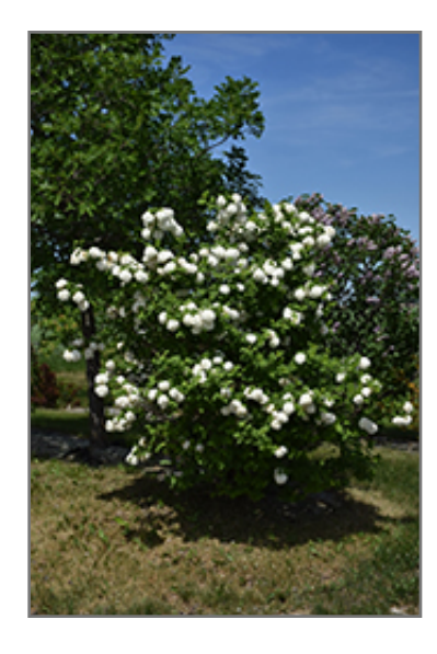
Snowball Viburnum in bloom

This shrub will require occasional maintenance and upkeep, and should only be pruned after flowering to avoid removing any of the current season's flowers. Deer don't particularly care for this plant and will usually leave it alone in favor of tastier treats. Gardeners should be aware of the following characteristic(s) that may warrant special consideration;