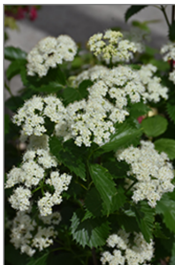
Blue Muffin Viburnum flowers