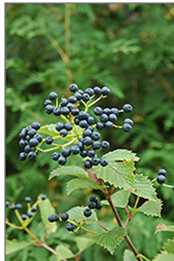
Blue Muffin Viburnum fruit

Blue Muffin Viburnum is recommended for the following landscape applications;