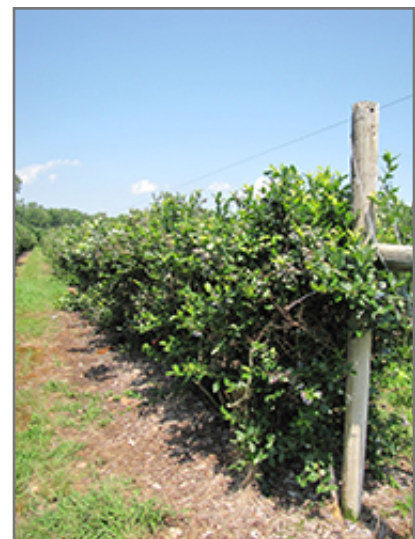
Patriot Blueberry fruit