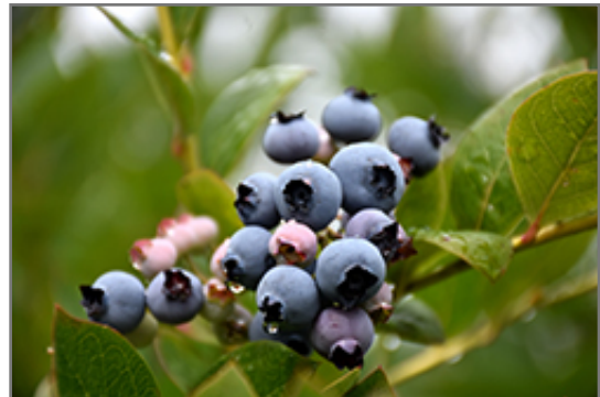
Patriot Blueberry fruit