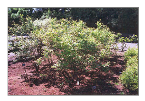
Northland Blueberry