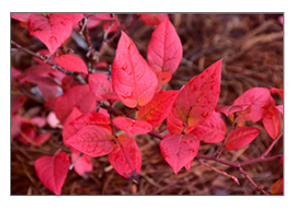
Northland Blueberry in fall