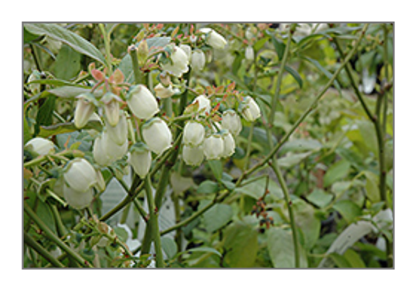
Bluecrop Blueberry flowers

This is a multi-stemmed deciduous shrub with an upright spreading habit of growth. Its average texture blends into the landscape, but can be balanced by one or two finer or coarser trees or shrubs for an effective composition. This is a relatively low maintenance plant, and usually looks its best without pruning, although it will tolerate pruning. It is a good choice for attracting birds to your yard. It has no significant negative characteristics.