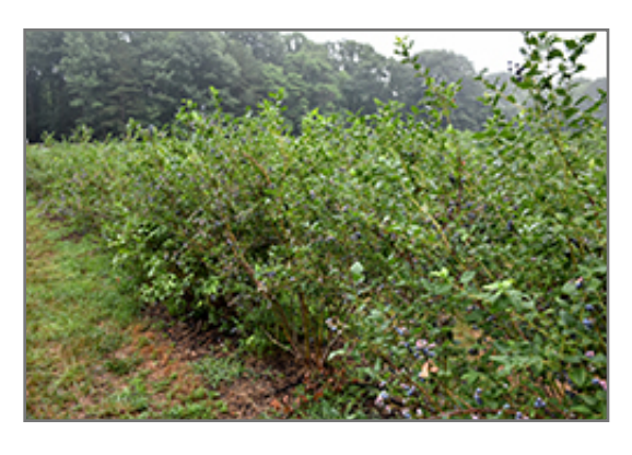
Bluecrop Blueberry fruit