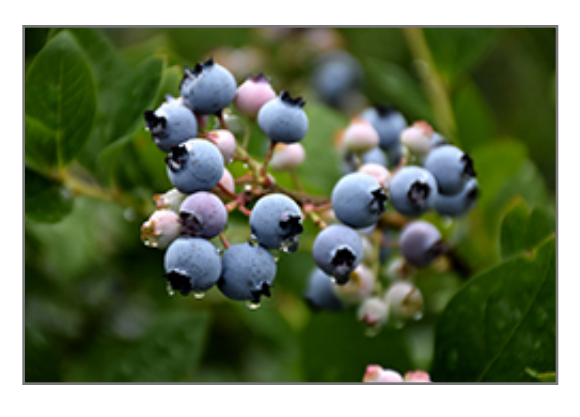
Bluecrop Blueberry fruit