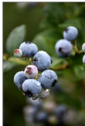
Polaris Blueberry fruit

Polaris Blueberry features dainty clusters of white bell-shaped flowers with shell pink overtones hanging below the branches in mid spring. It has green deciduous foliage. The glossy oval leaves turn an outstanding orange in the fall. It features an abundance of magnificent blue berries with purple overtones in mid summer.