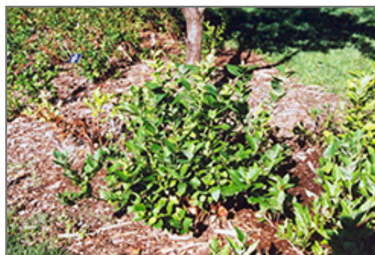
Polaris Blueberry