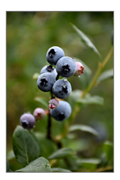
St. Cloud Blueberry fruit

This is a multi-stemmed deciduous shrub with an upright spreading habit of growth. Its relatively fine texture sets it apart from other landscape plants with less refined foliage. This is a relatively low maintenance plant, and usually looks its best without pruning, although it will tolerate pruning. It is a good choice for attracting birds to your yard. It has no significant negative characteristics.