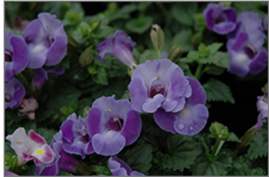
Blue Moon Torenia flowers

Blue Moon Torenia is recommended for the following landscape applications;