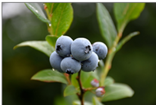
Northsky Blueberry fruit

Northsky Blueberry features dainty clusters of white bell-shaped flowers with shell pink overtones hanging below the branches in mid spring. It has green deciduous foliage. The glossy oval leaves turn an outstanding scarlet in the fall. It features an abundance of magnificent blue berries in mid summer.