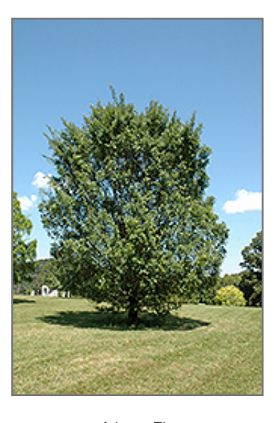
Athena Elm