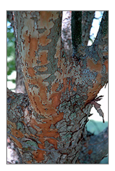
Athena Elm bark