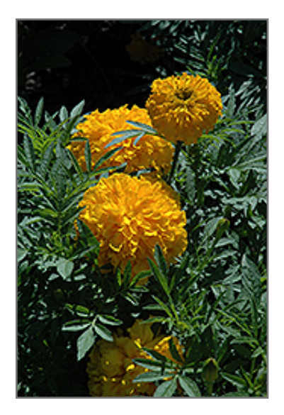
Bali Gold Marigold flowers

Bali Gold Marigold features bold fully double gold ball-shaped flowers at the ends of the stems from early summer to mid fall. The flowers are excellent for cutting. Its fragrant ferny leaves remain dark green in colour throughout the season.