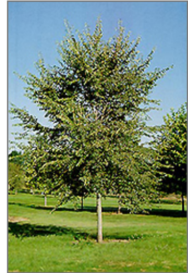
Homestead Elm

Homestead Elm will grow to be about 60 feet tall at maturity, with a spread of 45 feet. It has a high canopy of foliage that sits well above the ground, and should not be planted underneath power lines. As it matures, the lower branches of this tree can be strategically removed to create a high enough canopy to support unobstructed human traffic underneath. It grows at a fast rate, and under ideal conditions can be expected to live for 90 years or more.