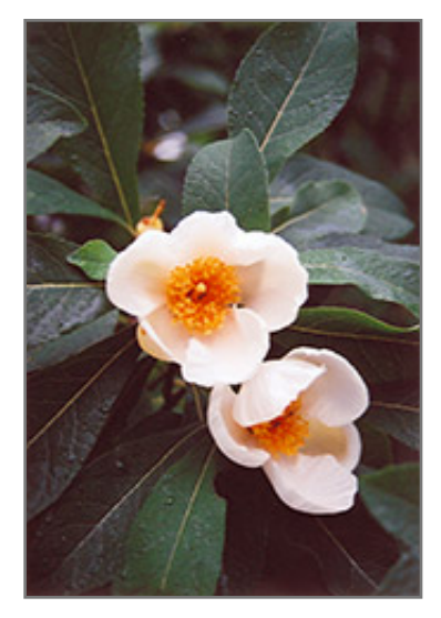
Franklin Tree flowers

This tree will require occasional maintenance and upkeep, and is best pruned in late winter once the threat of extreme cold has passed. Gardeners should be aware of the following characteristic(s) that may warrant special consideration;