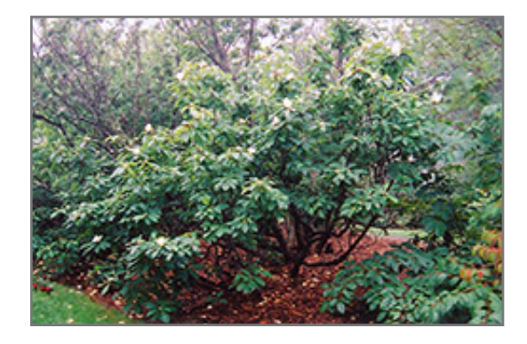
Franklin Tree in bloom