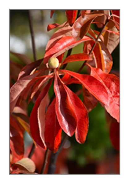
Franklin Tree in fall

This tree should only be grown in full sunlight. It requires an evenly moist well-drained soil for optimal growth, but will die in standing water. It is very fussy about its soil conditions and must have rich, acidic soils to ensure success, and is subject to chlorosis (yellowing) of the foliage in alkaline soils. It is quite intolerant of urban pollution, therefore inner city or urban streetside plantings are best avoided, and will benefit from being planted in a relatively sheltered location. Consider applying a thick mulch around the root zone in winter to protect it in exposed locations or colder microclimates. This species is native to parts of North America.