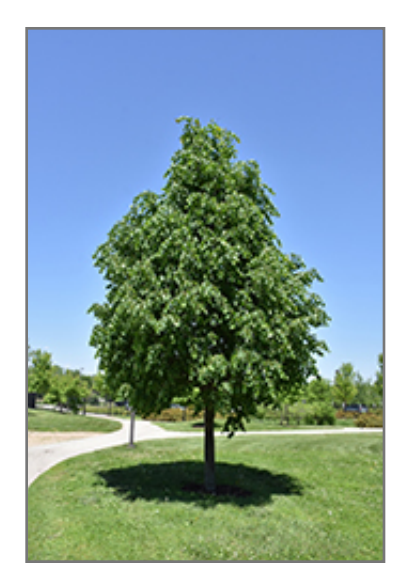
Greenspire Linden

This is a relatively low maintenance tree, and is best pruned in late winter once the threat of extreme cold has passed. It is a good choice for attracting bees to your yard. Gardeners should be aware of the following characteristic(s) that may warrant special consideration;