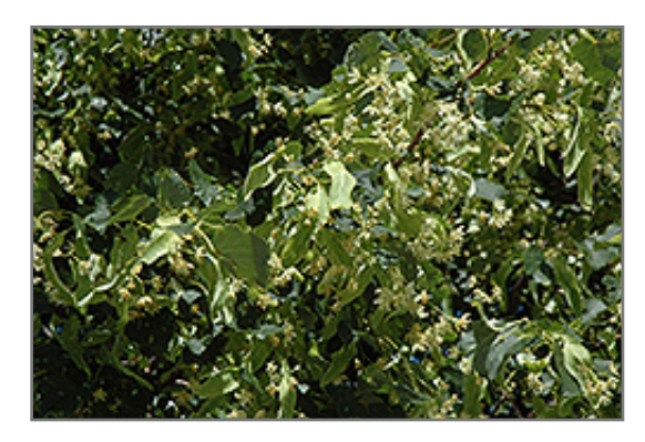
Greenspire Linden flowers