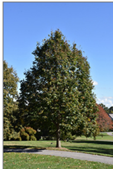
Redmond Linden

Redmond Linden is recommended for the following landscape applications;