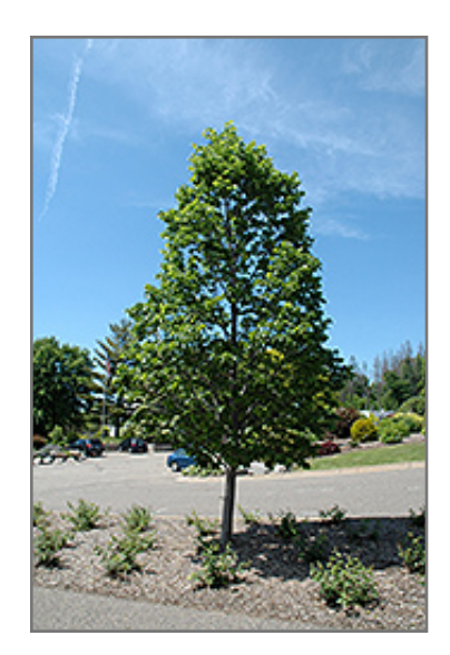
Boulevard Linden