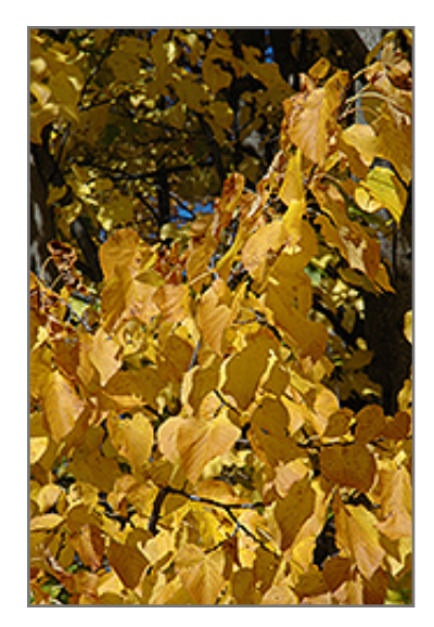
Boulevard Linden in fall